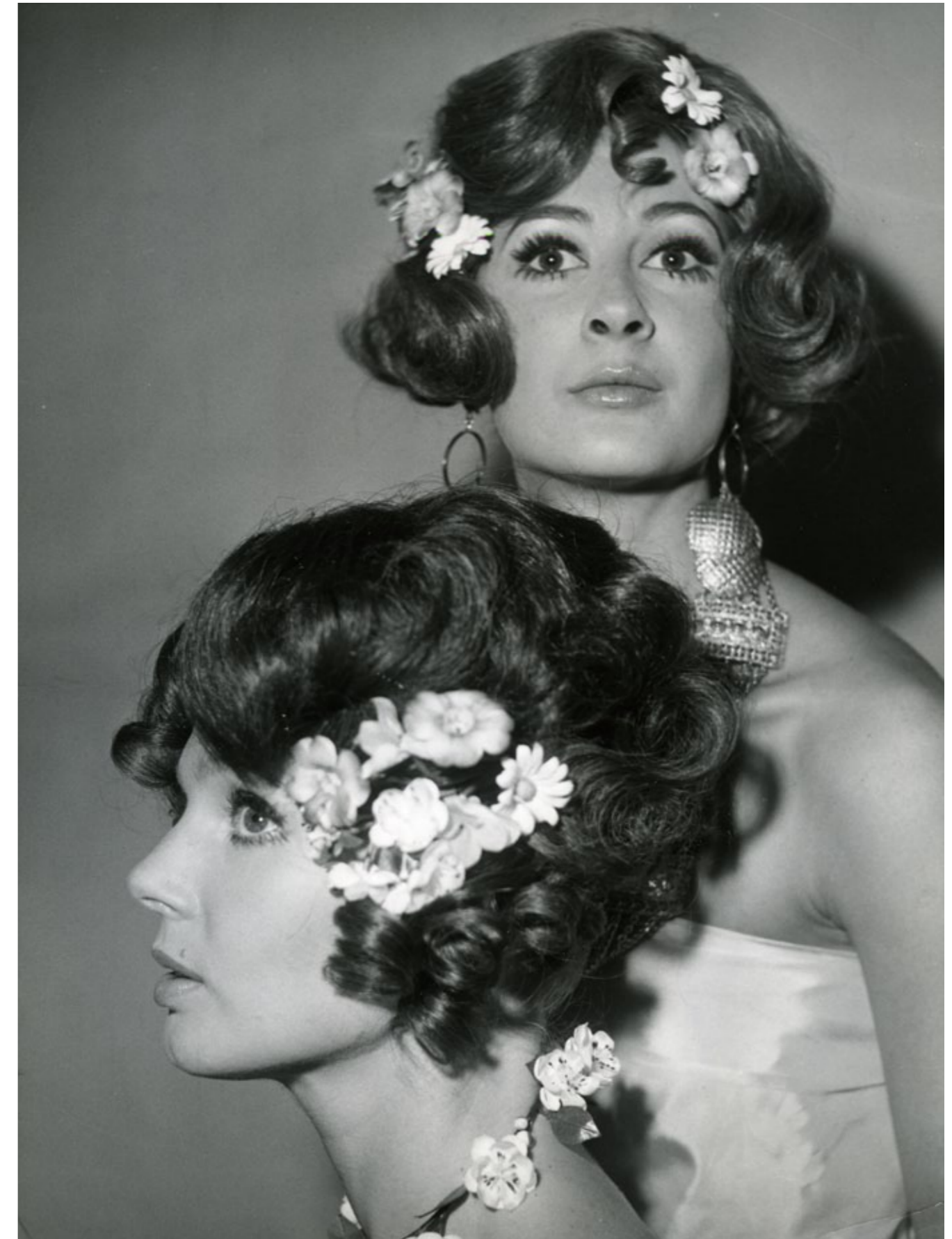
Springtime hairstyles by Molinaro, Paris, 1968