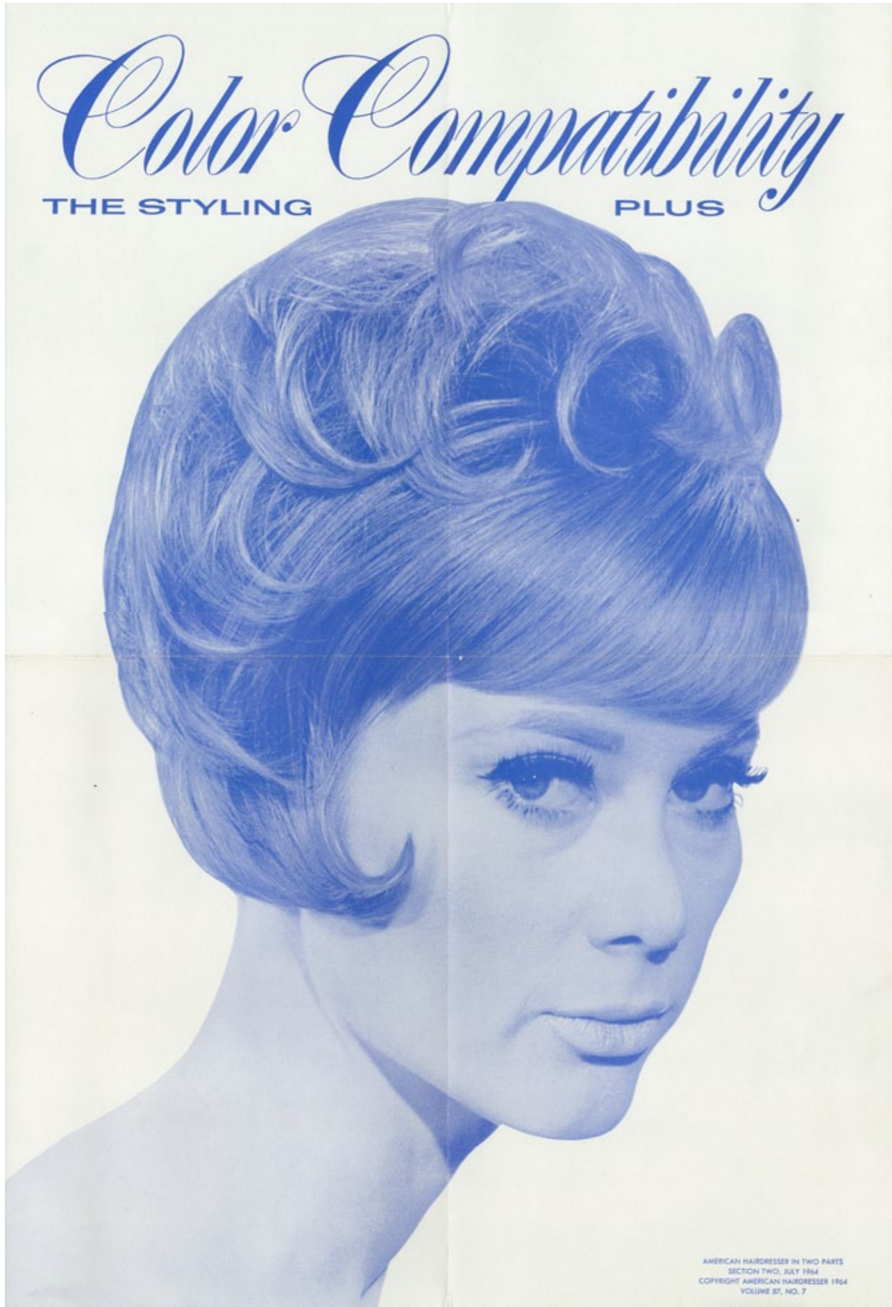
Hairstyle, 1964 American Hairdresser , January 1964