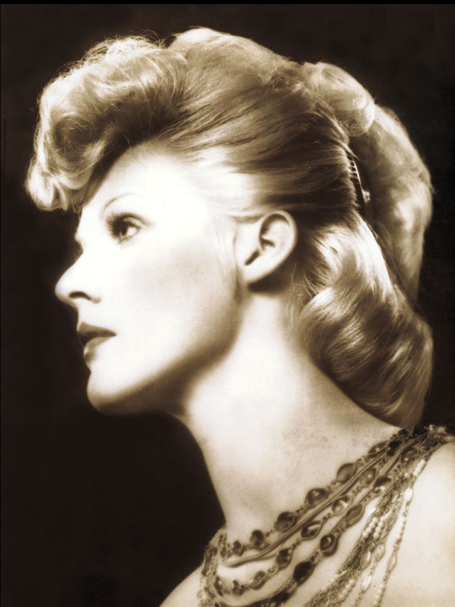
Hairstyle created by La Saint Sylvestre (Paris), 1972