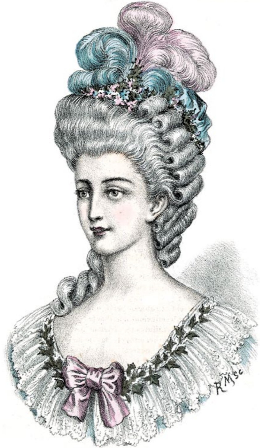
Coiffure Louis XVI

Coiffure Louis XVI ornamented with flowers and ostrich feathers, 1770s E. Nissy, Album de Coiffures Historiques